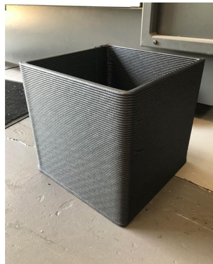
Figure 1: 3D printed test cube