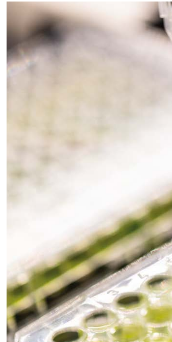
Laboratory scaling of algae cultivation in closed photobioreactors. The technical data generated here are the basis for the next process scale-up steps at the TUM AlgaeTech Center in Ottobrunn.