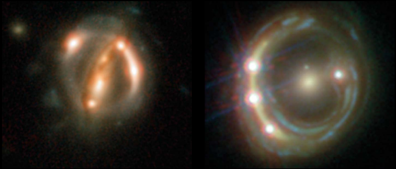
Hubble observations of different quasars and foreground galaxies. The gravitational fields of the galaxies act as gravitational lenses and create multiple images (bright dots) of the quasars. These and other quasars were studied by the H0LICOW collaboration to make an independent measurement of the Hubble constant.