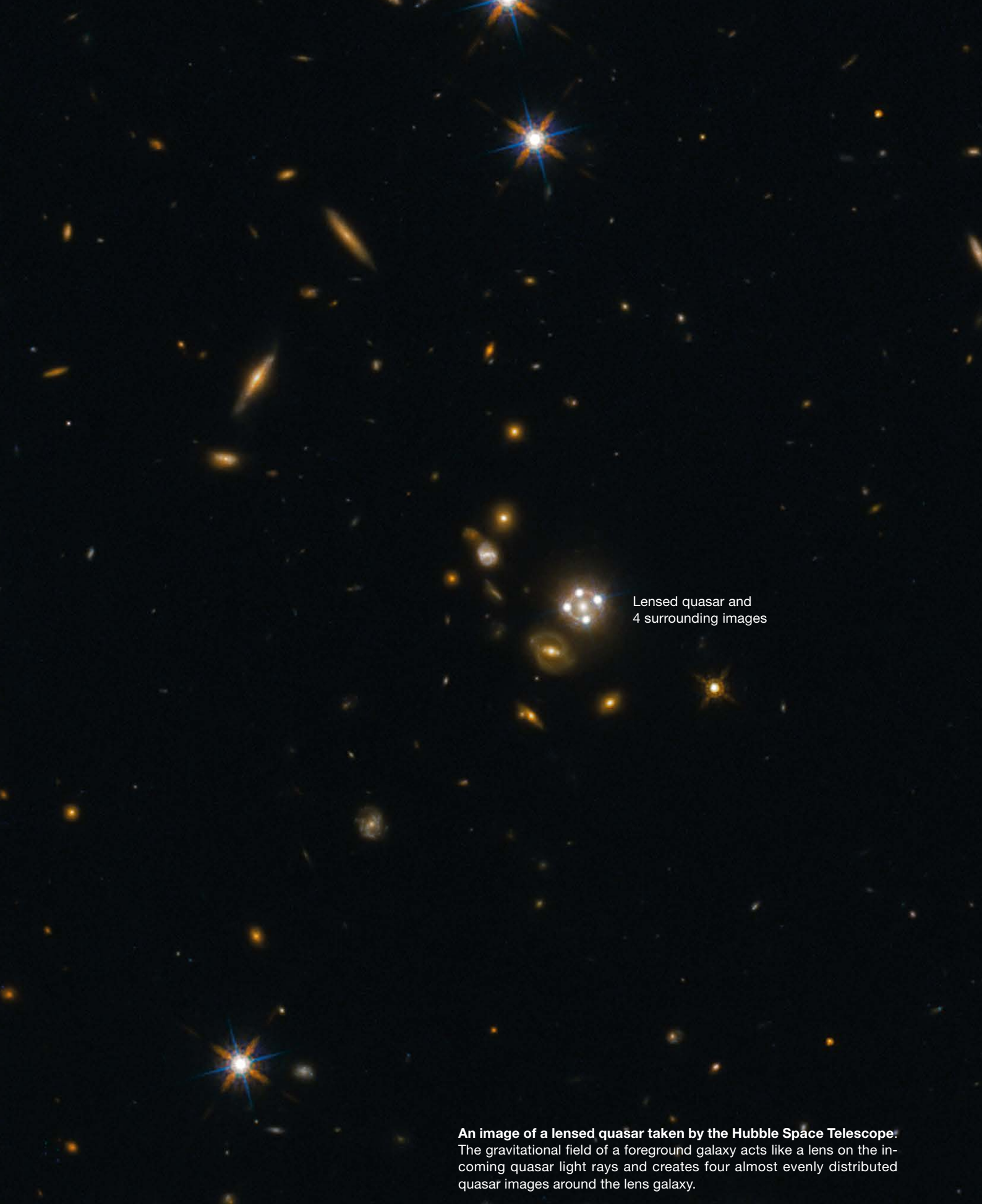
Lensed quasar and 4 surrounding images