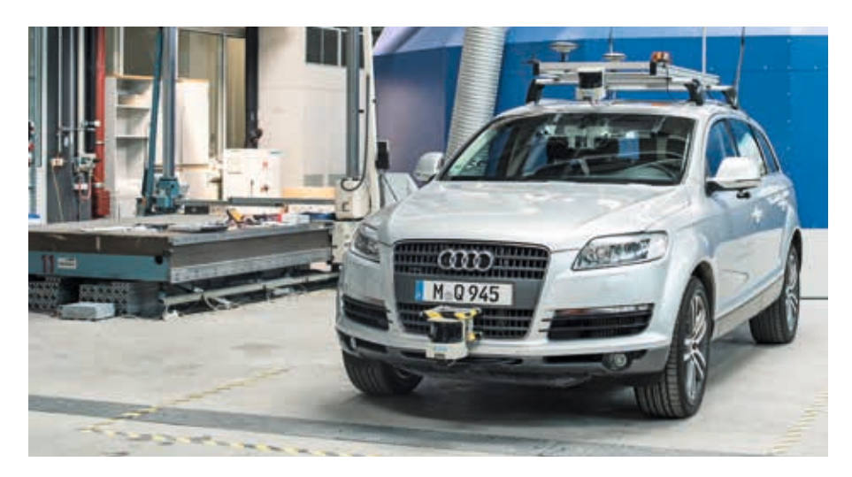
Diermeyer's group is currently testing teleoperated driving in a mass-produced vehicle, which is also equipped with sensors monitoring its surroundings.