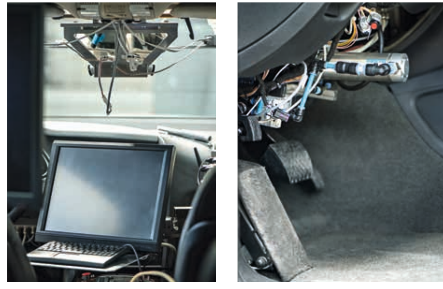
Camera systems record the front and side view from the cockpit. All images are transmitted via mobile communication to the operator, who controls the steering wheel and pedals.