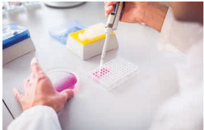
Immune cells are isolated from inflamed tissues, for example the central nervous system, and functionally analyzed in culture plates ex vivo.

other T cells from migrating into the brain. However, when T cells outside the brain are activated, for instance by a harmless cold virus, they gain the ability to cross this barrier after all. Or at least, that is the theory.